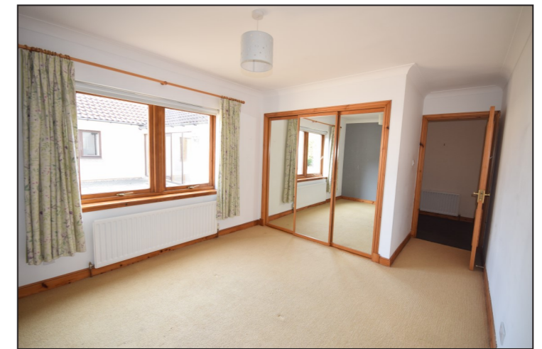
Bedroom 4 (W) Mirror wardrobes. Radiator. 3.68m x 3.28 12' x 10'9"