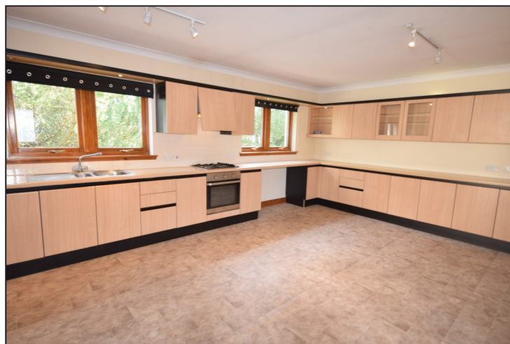
Kitchen (N)(E)(W) Fitted floor and wall units. Largest Sizes 7.64m x 6.67m 25'1" x 21'10" NEFF hob. Beko oven. Neff extractor fan. Telephone and TV point.