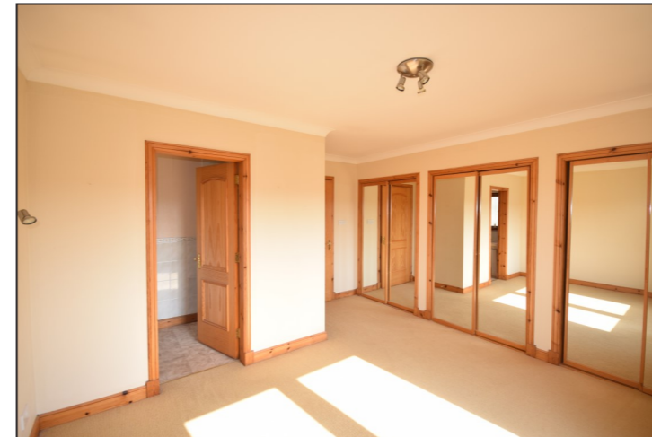
Bedroom 2 (S) Telephone Point. Radiator. 4.67m x 3.35 15'4" x 11'