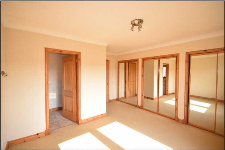
Bedroom 2 (S) Telephone Point. Radiator. 4.67m x 3.35 15'4" x 11'