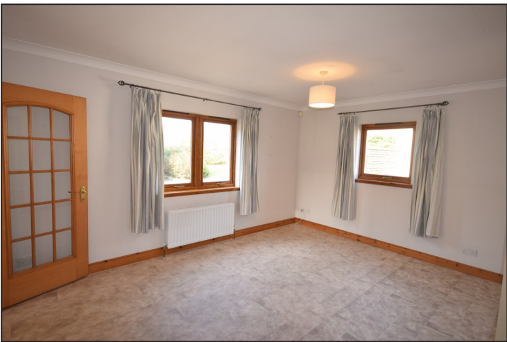
Utility Room (N)(E) Door to drying green. Hoover washing machine. Extractor fan. 3.16m x 1.51m 10'4" x 5"