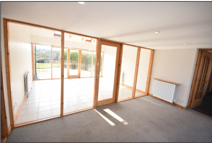
Sitting Room (S) Door to garden. Radiator x 3. 6.65m x 5.3m 21'10" x 17'4"

Dining Room (S) Door to garden. Radiator x 2. 4.54m x 4.16m 14'11" x 8'9"