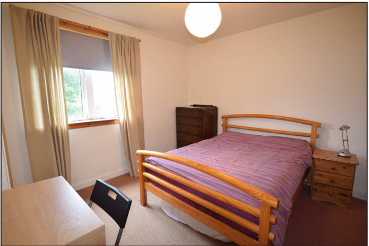
Bedroom 2 (E) Fitted wardrobe. Radiator. 11' 5" x 11' 6" 3.50m x 3.48m