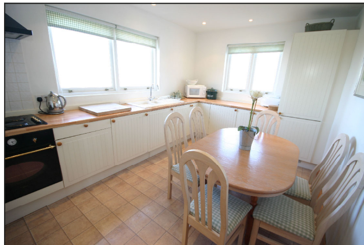
Dining Kitchen (N & E) 13'10" x 9'7" 4.23m x 2.94m

Working open fire with Victorian cast iron surround and timber mantle. Shelved storage cupboard. Shelved alcove. 2 radiators. Television point. 5amp lamp circuit.