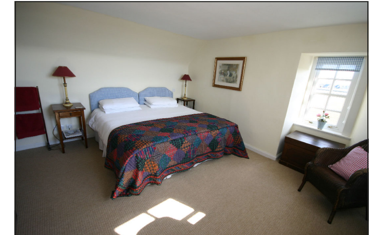
Bedroom 2 (S & W) 12'8" x 11'7" 3.88m x 3.55m Coombed ceiling. Radiator. 5 amp lamp circuit.

En-Suite (N) 7'8" x 5'7" 2.34m x 1.73m W.C. Wash hand basin. Corner shower cabinet with Hansgrohe power shower. Shaving point. Wood panelled to dado height. Velux window. Coombed ceiling. Radiator.