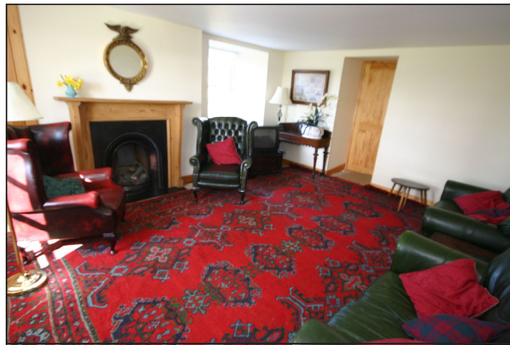
Sitting Room (S & W) 15'7" x 13' 4.77m x 3.98m

Hall (S) 14'10" x 4'1" 4.54m x 1.25m Understair cupboard housing intruder alarm controls, central heating controls and electric meter. Under window storage. Wall lights. Radiator.