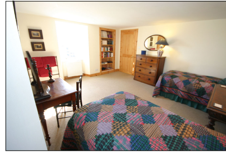
Bedroom 3 (S & E) 15'6" x 12'8" 4.73m x 3.88m

Cloakroom (W) 5'2" x 2'10" 1.59m x 0.87m W.C. Wash hand basin. Sector extractor fan. Wood panelling to dado height. Radiator.