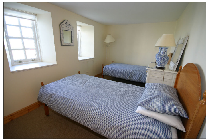
Bedroom 4 (N) 14'1" x 8'1" 4.30m x 2.47m

Storage cupboard with shelved and hanging space. Shelved alcove. 2 radiators. 5 amp lamp circuit.